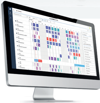
PLANNING BOARD (PPS)