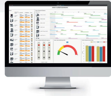
PRODUCTION COCKPIT (DASHBOARD)