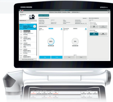
PRODUCTION FEEDBACK (PDA)